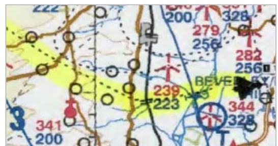
Figure 1: Unit Investigation Snapshot

A unit investigation was carried out by the Typhoon operating authority. Figure 1 is a snapshot from planning data which highlights the Typhoon's track and shows that the closest it planned to come to the airfield boundary was not less than 1nm. HUD data shows the Typhoon at 700ft AGL when the Cessna comes into view, high in the left 10.30. Immediately after the Cessna appears in the HUD field of view, the Typhoon is manoeuvred through a left-hand turn.