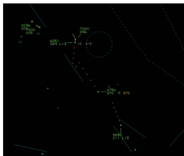
Figure 5: Geometry at 13:44:07

At 13:43:29 (Figure 4), the Typhoon and Microlight both turned towards each other and began closing distance. At 13:44:07 (Figure 5), the Typhoon and Microlight were at their closest point, with separation of approximately 0.5nm and 300ft.