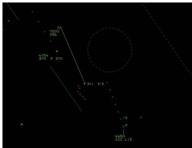
Figure 3: Geometry at 13:43:04