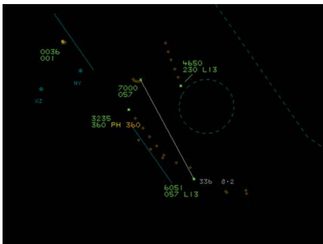
Figure 2: Geometry at 13:41:27 (Typhoon 6051; Microlight 7000)