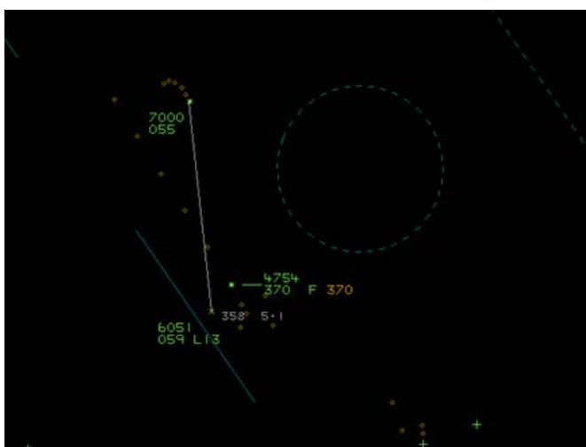
Figure 4: Geometry at 13:43:29 (Typhoon 6051; Microlight 7000)