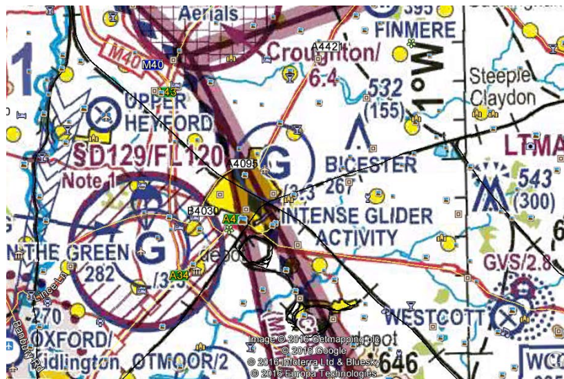
Figure 2 – Southern England and Wales 1:500,000 Aeronautical Chart

The London Information Flight Information Service Officer was providing a Basic Service without reference to surveillance derived information to the A109 in Class G (uncontrolled) airspace. A Basic Service relies on the pilot avoiding other traffic, unaided by controllers/FISOs. The provider of a Basic Service is not required to monitor the flight (and) pilots should not expect any form of traffic information from a controller 2 .