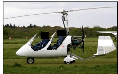
Figure 1. an MTO Sport Gyroplane (library picture)

THE GYROPLANE PILOT reports flying with a student, with navigation, landing and strobe lights illuminated, and in communication with Rochester Information. They were operating in the visual circuit at Rochester Airport, at 1000ft (QFE 1000hPa), where a Robinson R22 helicopter was also operating. On their third circuit, the Gyroplane pilot heard the R22 pilot report that he had seen a model aircraft on the ground. As they approached final, the instructor and student both looked and saw the white delta or boomerang shaped model aircraft still in the field, it was white and stood out against the green field; they noted that it was still there on their next circuit, but that it had gone on their next circuit. Carrying out a further circuit, they positioned for final approach to RW02 at 70kt, and the model appeared at their height (1000ft) and 'came straight for' them. The instructor immediately took control, banked the aircraft sharply right, and estimated that the model came within 10ft of them. The student was quite shaken, so the instructor elected to land and reported the Airprox to ATC; he assessed that the model had a wing-span of 5-6ft.