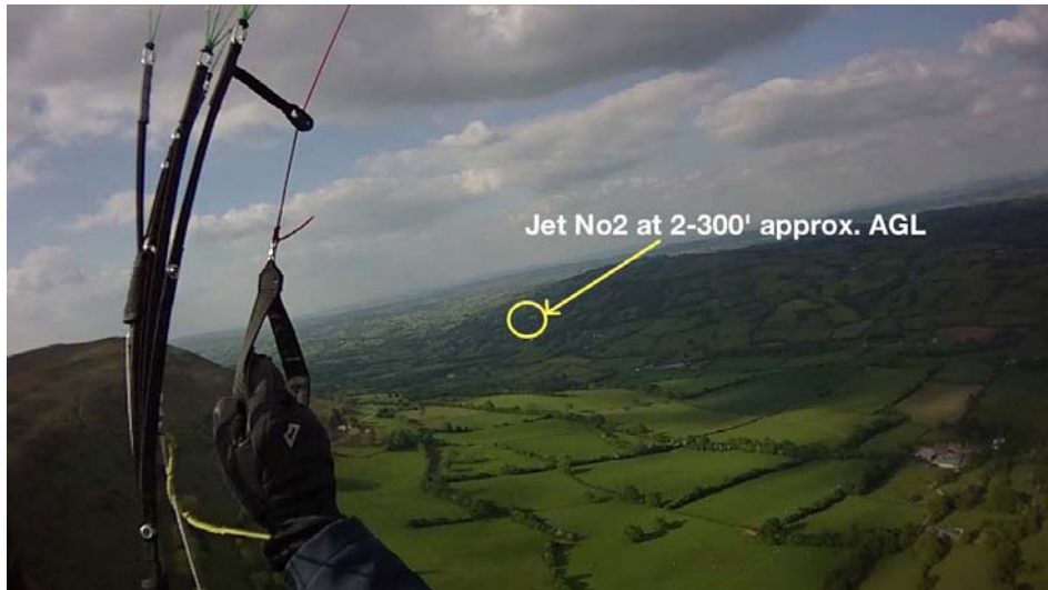
Figure 1. The Lead Tornado ac labelled 'Jet No2'

The paraglider pilot reports that he checked the NOTAMs in the morning before his flight but did not submit a CANP for his flight because he made the decision to fly shortly before he took off and he was planning to fly cross-country, which would mean notifying an extended and uncertain area. He commented that it was common for paragliders and sailplanes to use the launch site on the Pandy Ridge but he was not sure if a CANP had been submitted by one of the '15 or so Paraglider pilots flying that day'. Figure 1 shows a photograph from the paraglider pilot's helmet camera taken at 1633, looking N up the Pandy Valley, at 1600ft amsl, indicating the lead Tornado, which was the E'ly of the two and is labelled 'Jet No2'.