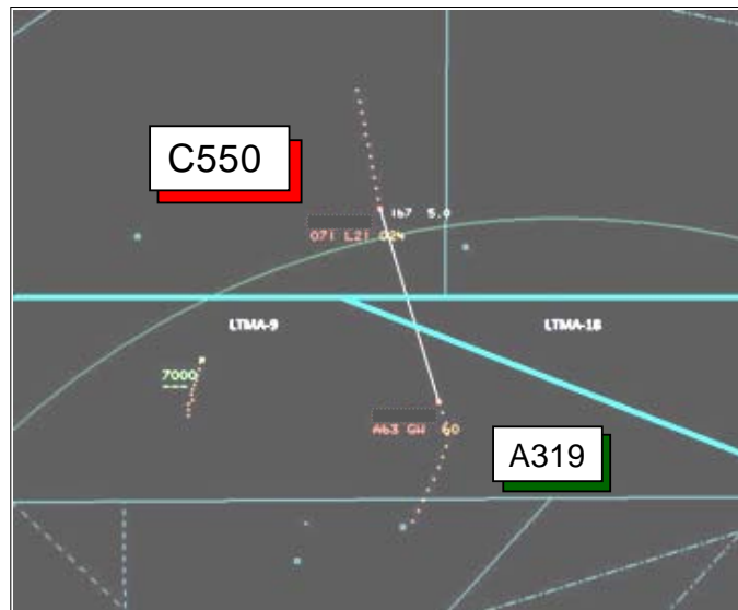
Fig 1 - 1446:32

At 1446:21, STCA activated at low level – white - and recorded radar data shows the distance between the two ac as 6.5nm. The controller immediately issued avoiding action, “[A319 C/S] avoiding action continue that turn left heading 2-1-0 degrees there’s unknown traffic 4 miles north of you 7 thousand 1 hundred feet descending. ” At 1446:32, STCA activated at high level - red (see Fig 1). The A319 pilot responded, “ Copied left heading 2-1-0 degrees [A319 C/S] ”. The A319 is shown indicating an altitude of 6300ft with the C550 indicating FL71. [About 6650ft London QNH (998hPa).]