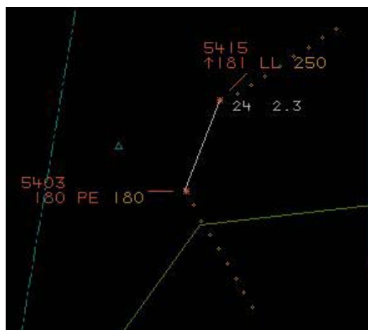
Figure 1: 0833:08 UTC (Prestwick Multi Radar Tracking)

Separation was lost at 0832:52 as the A319 climbed through FL175 in the Saab 2000 pilot's half-past-one position at a range of 4.6nm. Minimum distance between the two aircraft occurred at 0833:08 as the A319 climbed through FL181, 2.3nm from the Saab 2000 (see Figure 1 below). Separation was restored at 0833:20 as the Saab 2000 pilot descended through FL175 with the A319 crossing right to left through its 12 o'clock climbing through FL188.