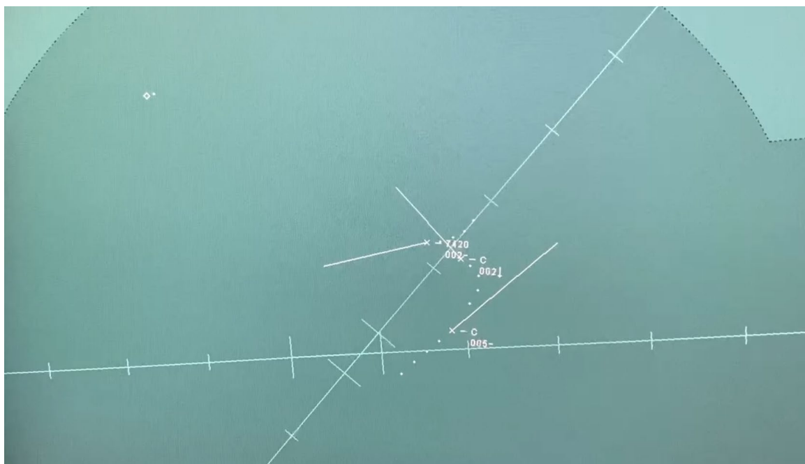
Figure 1: CPA

Neither aircraft appeared on the NATS Ltd area radar replay at the time of the Airprox, however, RNAS Yeovilton supplied a manually recorded replay of the Yeovilton area radar (see Figure 1), from which the Part A diagram was assembled. Timings were not shown on the Yeovilton recording; the time at CPA was estimated from the Tower R/T transcript.