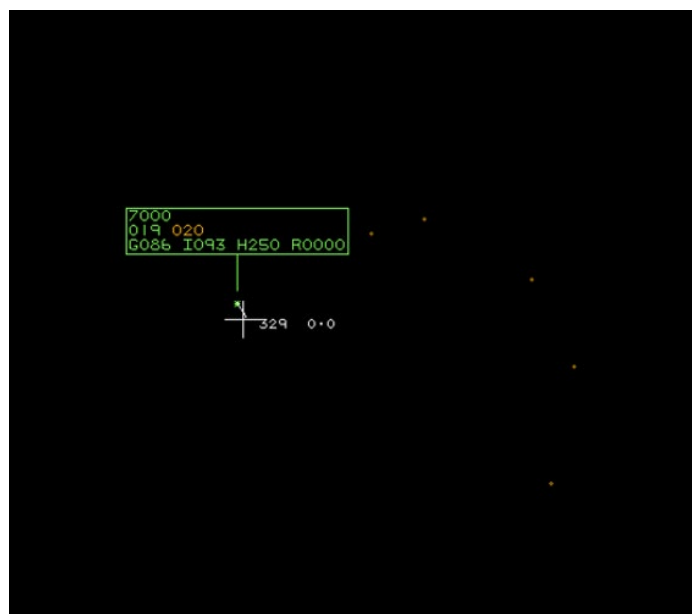
Figure 1 – Reported point at time 0824:27

An analysis of the NATS radar replay was undertaken for the period of the flight that the DA42 pilot had operated in the vicinity of Grafham Water. The unknown aircraft was not observed on radar at any point.