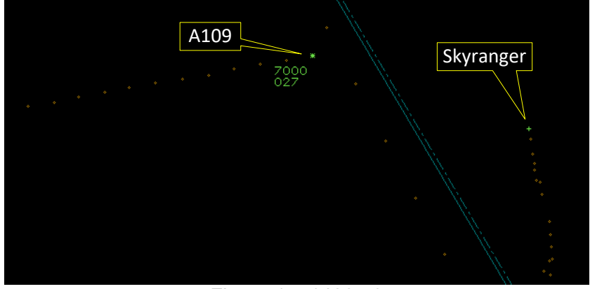
Figure 1 - 1428:59

An analysis of the NATS radar replay was undertaken. A primary-only contact was observed which, by reference to the pilot's narrative report, was determined to have been the Skyranger. The A109 could be positively identified by Mode S data (Figure 1) and was depicted on the radar replay at a Flight Level. A suitable conversion factor was used to determine its altitude.