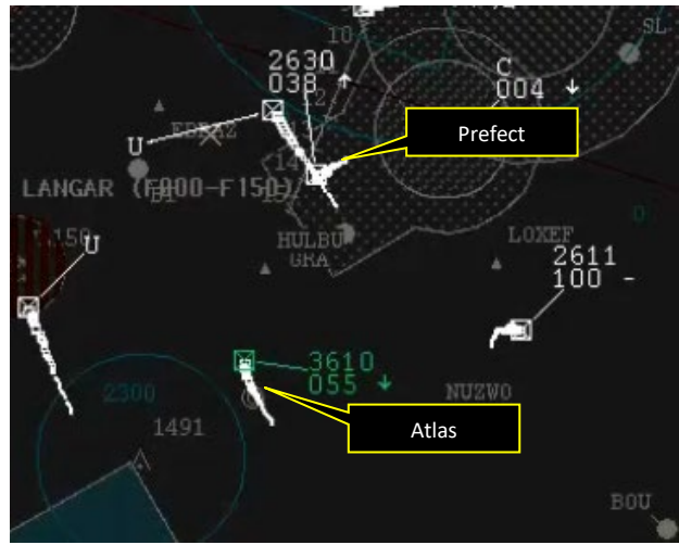
Figure 3 (0937:55): Traffic Information provided to the Atlas pilot on the Prefect. (Separation: 6NM and 1800ft)

Whilst still on the landline to the Cranwell Approach controller, at 0937:55 the Waddington Director controller provided Traffic Information to the Atlas pilot on the Prefect and offered an option to stop the descent. "Traffic north north-east, five miles, tracking south-west, indicating One Thousand Two Hundred feet below, climbing, would you like to stop your descent?" The Atlas pilot elected to stop the descent at altitude 4700ft.