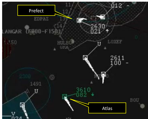
Figure 1 (0936:54): Atlas pilot issued own navigation for HULBU. (Separation: 10.6NM and 6400ft)

At 0936:54, the Atlas pilot was provided own navigation for the HULBU reporting point and requested to report at the Initial Approach Fix by the Waddington Director controller.