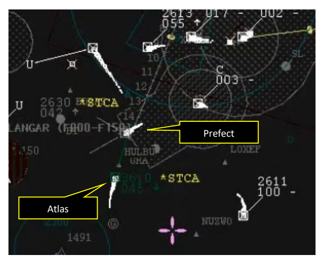
Figure 4 (0938:25): Traffic Avoidance right-hand turn offered to the Atlas pilot. (Separation: 3.3NM and 300ft)

The Cranwell Departures controller, responding to the own navigation statement, instructed the Prefect pilot to maintain current track for traffic avoidance. "Maintain er current er track, there's er traffic south er one and a half miles tracking northeast indicating similar altitude".