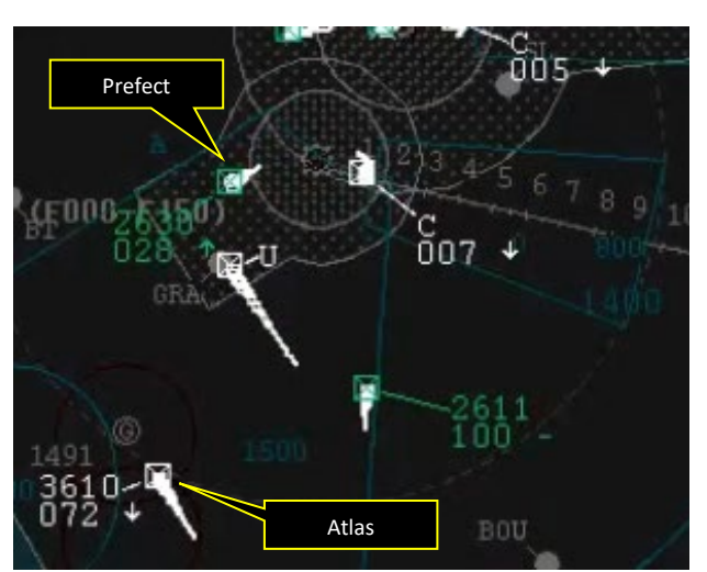
Figure 2 (0937:17): Traffic Information provided to the Prefect pilot on the Atlas. (Separation: 9NM and 4800ft)

At 0937:07, the Waddington Director controller contacted the Cranwell Approach controller both to provide Traffic Information regarding the Atlas, and to request a Barkston Heath stub crossing to facilitate the RNP procedure. The Cranwell Approach controller denied the Barkston Heath stub crossing, pointing out the Prefect departing to the west. The Waddington Director controller requested the Prefect pilot's intentions, in particular 'what they are climbing to?'