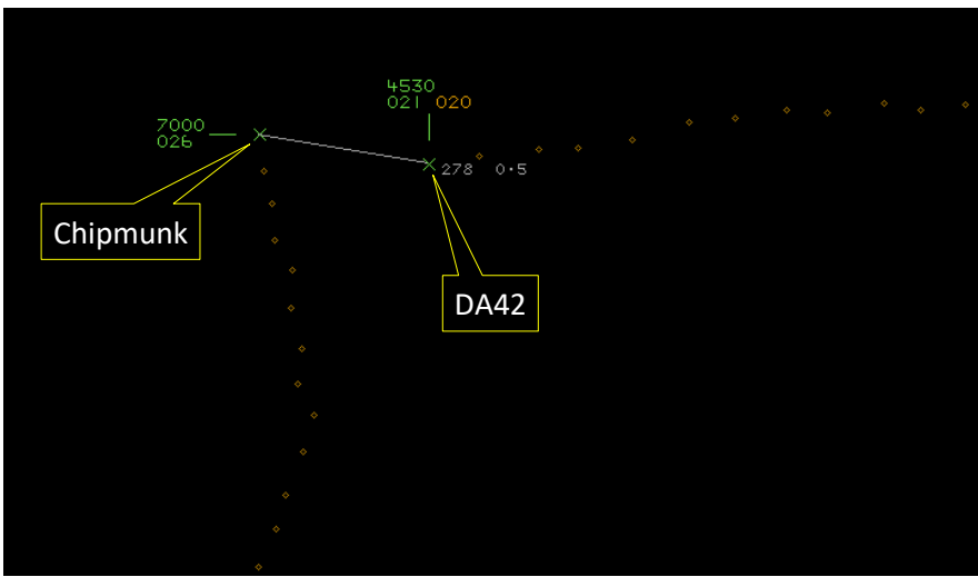
Figure 2 - CPA at 0958:26

The DA42 and Chipmunk pilots shared an equal responsibility for collision avoidance and not to operate in such proximity to other aircraft as to create a collision hazard.<sup>1</sup>