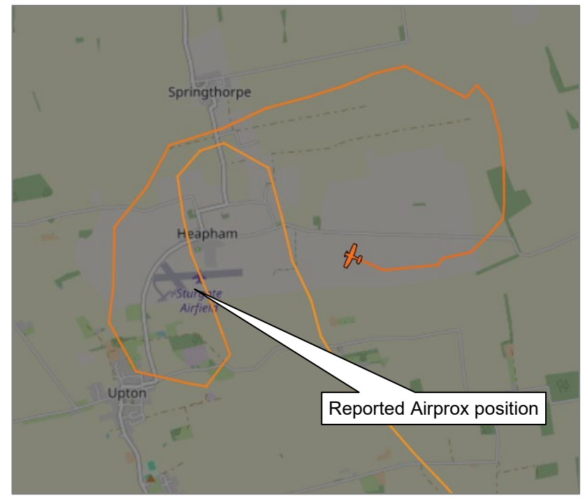
Figure 2: This MLAT trace shows the path of the PA28 on its approach to RW27 at Sturgate, with the snapshot taken at the time the PA28 ceased to refresh (1141:00). The second aircraft did not appear.

The PA28 pilot reports that, on sighting the second aircraft, they had taken avoiding action by increasing their rate of descent significantly. Radar tracing showed that descent to have been approximately 500ft in around 10sec. The second aircraft did not show on radar, ADS-B tracking tools or the CAA's Airspace Analyser Tool.