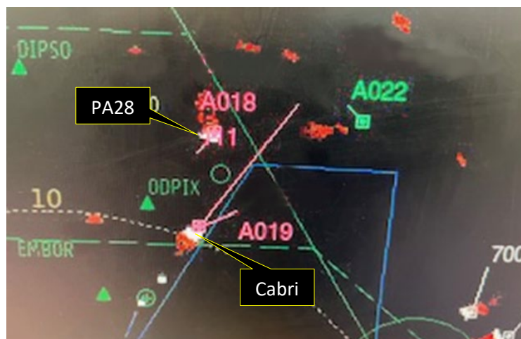
Figure 2 – 1340:35