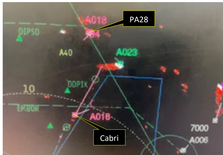
Figure 1 - 1339:30